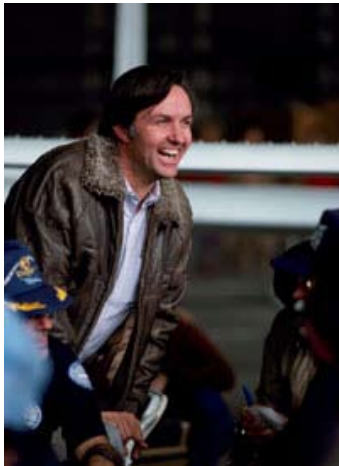
Voyager Aircraft Program Burt Rutan shows his pride in a hangar at Edwards AFB after the successful landing of the Voyager on December 23, 1986. The Voyager was a unique aircraft designed by engineer Burt Rutan to fly around the world non-stop and non-refueled. The craft piloted by Dick Rutan and Jeanna Yeager achieved its milestone goal in December 1986 after flying around the world in slightly over 9 days.

Burt Rutan's list of airplanes designed and flown (45), of honorary Doctoral Degrees (6!), of national and international awards (112... not counting the milk drinking contest he won at the age of 12), of patents held (7), and of design projects related to aviation in some way (several hundred) takes up 11 pages! This all occurred in the years between 1965, when he graduated from California Polytechnic University, and his retirement from Scaled Composites in April, 2011. It includes a work schedule that would have crippled most people: escalating over the forty-six years he spent in the high desert to six or seven days a week, 8 to 16 hours a day. Vacation time was rare. "I think the main reason is there wasn't much to do in Mojave. I kept my head down and my elbows up and I worked like hell." When he retired, he found "with a clear calendar, I could sleep in and then decide on a given day what I would do after I woke up. That concept was so foreign to me that it was absolutely amazing. I still haven't gotten used to it." He's still looking for the "off" switch.