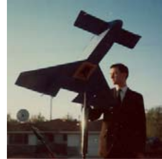
The car Top VariViggen model ready for the automotive wind tunnel.

“The fascination of having my own fighter, which would allow me to sit in the front and have my hand on the throttle, provided the major reason for doing the VariViggen.” Burt had joined EAA in 1965 and while he was working for the Air Force, he joined EAA Chapter 49, but he had to put off the start of construction because he was working seven days a week and had no spare time. What little time he did have went into the construction of another wind tunnel model of the VariViggen, but this was after Cal Poly and he had no wind tunnel. So he used his car, mounting the model above the roof of his Dodge Dart. It was an articulating mount with instruments. Driving down roads, he was able to simulate a wind tunnel of his own making. He then built an RC model of the VariViggen and flew that shortly before flying his completed homebuilt. That happened late in 1971 while he was in St. Louis supporting the F-15 program.