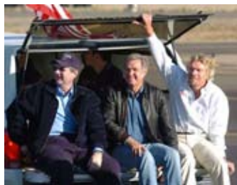
Good Company: Paul Allen, Burt Rutan and Sir Richard Branson

At its peak, RAF employed five people. Scaled composites started with six employees and grew to about thirty-five when the Starship made its first flight in 1983. After that it was common at Scaled to see three or four designs being built in the shop while two or three more were in flight testing, when employment was well less than 100. When Scaled