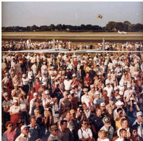
The Voyager at Oshkosh