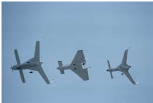
The Defiant leads the VariViggen and VariEze.

Burt continued to attend the annual Oshkosh Convention. From 1976 to 1986 RAF rented a 10' by