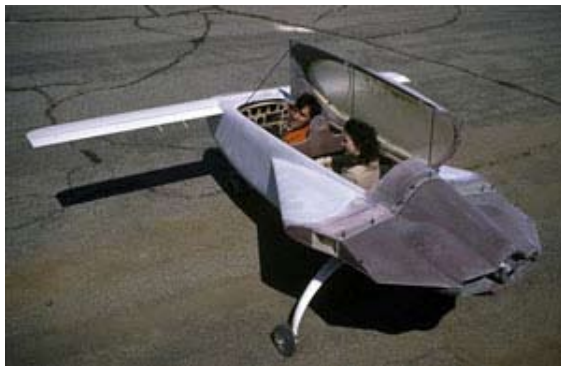
The first VariEze in the early stage of construction.

Germany and Switzerland. It was a technology that was still in its infancy in America. These sailplanes were produced in tooling that utilized vacuum bagging of fiberglass impregnated with resin. Carved foam was then set inside the upper and lower surfaces of the wings. When they were dinged in an accident, Fred would shape foam to fill the hole and then lay new fiberglass over it. He didn't need tooling to fix wings. These "moldless" repairs inspired Burt. He began to conceive of his VariEze as an all-composite aircraft.