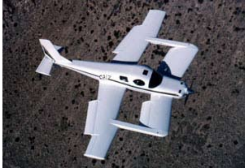
Burt's highly unusual design by anyone's standard.... the Grizzly.

ask the question anymore: "What will Burt turn up with next?"