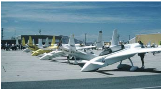
Long EZs and VariEzes on the ramp at Mojave.