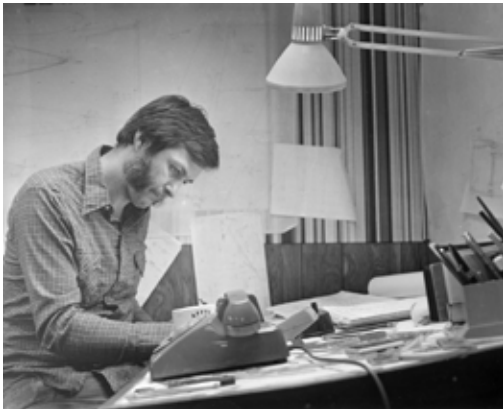
Burt Rutan at his drawing table in the Pre-CAD days.

Los Angeles was out because the high cost of hangars and shop space. He borrowed his uncle's Ercoupe and went down to Brown Field on the Mexican border, then looked at Montgomery, Ramona, Flabob and a host of others. He was shocked by the prices people were asking. "Once I got to Mojave, I found this old, nearly abandoned airport with a few run down wooden buildings on it and the hangar rent was almost nothing and the shop rent was almost nothing, because they had all this empty space. I found a house nearby that had a low enough price and so it turned out that Mojave was the first place I'd found where I thought I could survive on cost. The other thing was that it was close to Edwards, and if my business failed I could always try to get my old job back with the Air Force."