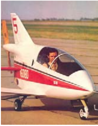
Burt Rutan in a BD5

a job, knowing it would probably only last about a year. I planned to return to Edwards within a year to hold onto the benefits associated with that job. I didn't like the BD-5, but I went to work for him with the idea that I would have fun and learn."