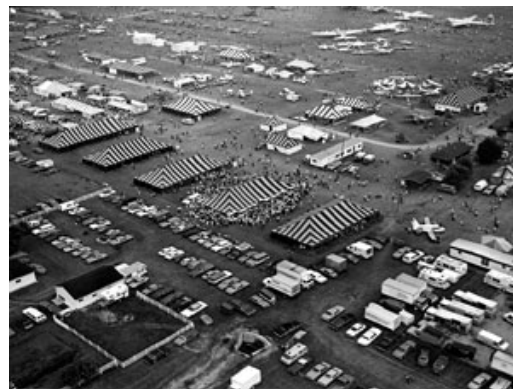
Burt has held forums every year he's been at Oshkosh. You can guess which tent he was in for this forum.

People began sending money in, even though he didn't yet have anything to sell. After his experience with Jim Bede, Burt had resolved never to accept money until he had a product that was fully flight tested and complete. He sent the peoples' money back, refusing to take any deposits until a month before Oshkosh '76. At that time, he put the word out to the thousands of people who had subscribed to his quarterly newsletter (this was before the internet and websites). A couple days after sending out his newsletter, announcing the availability of plans, some guy flew in from San Diego in a Cessna 182 and paid for a hundred sets of plans. He took a full third of Burt's inventory of plans and grossed out his Skylane with them. Then he took off and flew back to an eager bunch of builders,