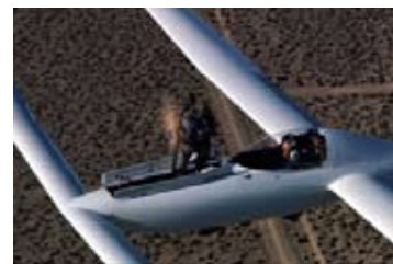
The Solitaire's retractable engine.