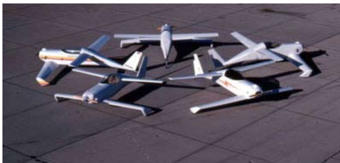
A grouping of Quickies