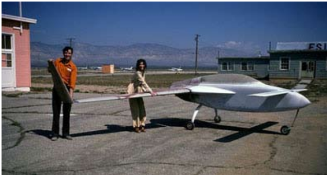
One of the prototype wings for the VariEze.