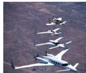
The Beech Starship and friends.

undertook the Paul Allen manned space program in 2001, it was not their largest effort, in spite of the fact that they employed less than 140. When Burt retired in March 2011, the company had nearly 400 people on the payroll and was developing SpaceShip Two, the world's largest manned commercial space system. Last December, Scaled revealed that it was developing Stratolaunch, the world's largest aircraft; a design stemming from Burt's preliminary work that was started back in 1991.