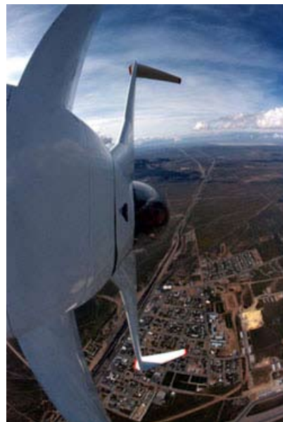
LongEZ flown through one of those YeeeeHAAh!!! maneuvers.

Long-EZ was introduced in 1980 and it became the most popular and longest-range homebuilt in the world. Its distance records still stand today. The rest, as they say, is history and it's been well documented. After 1985, RAF developed two high performance prototypes, the 5-place Catbird which won the CAFÉ