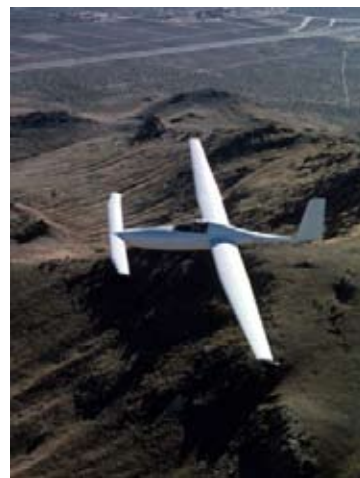
The Solitaire, a self-launching sailplane.

By 1996, Burt's second company, Scaled Composites, was 14 years old and was demanding so much of Burt's time that he just didn't have time for homebuilders. He had sold his last set of plans to a homebuilder in 1985 but continued to support his builders for over 20 years with newsletters, even though there was no revenue to cover the costs of the newsletters. "I never charged for builder support, because I didn't want people shunning it and