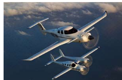
Catbird & Boomerang

people were guessing what this White Knight was for. The idea that a private company could develop their own space program without government funding was unheard of and un-thought of.”