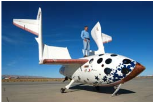
SpaceShip One and the Rocket Scientist.

from big aerospace firms and from the Government, gaining their confidence to do important research work. When RAF had only four employees in the 1970s, it designed the skew-wing AD-1 research