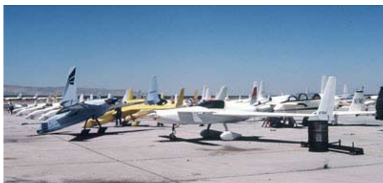
VariEzes and Long-EZs gathered at Mojave for a celebration of composite aircraft.