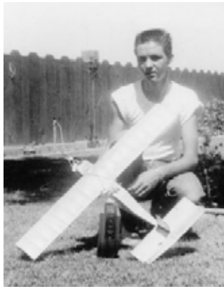
A very young Burt Rutan with one of his scratchbuilt model airplanes...it was his passion through high school.