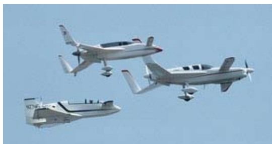
The VariEze (closest), Defiant and the VariViggen.

Not everything at RAF had turned to gold. Burt finally started selling plans to the Defiant six years after he flew the prototype and he only sold plans for a year with about a hundred sets going out the door. The Solitaire was even less popular. The self-launching sailplane cost more to develop than the VariEze and Long-EZ combined,