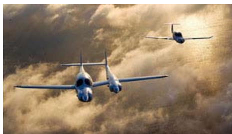
Catbird & Boomerang

“Most of the program was completely covert and