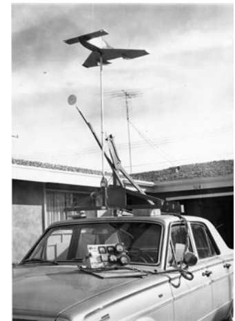
VariViggen Car Tunnel Model, showing the instruments to measure the effect of wind.

VariViggen. It was to be built out of wood and metal. He conducted wind tunnel tests on the concept at Cal Poly in 1964, but didn’t begin building it until 1968. Finished in 1972, Burt