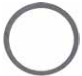
FUEL PUMP GASKET - 649962