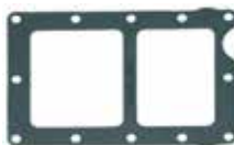
TCM OIL GASKETS

TCM 654555 Oil Cooler Gasket for Continental Engines .....P/N 06-02162 -----