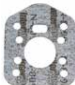
LYCOMING PROP GOVERNOR GASKET

Propeller governor gasket for Lycoming O-320 A & E Series engines .....P/N 72053 -----