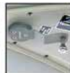
Overhead Trim Replacement Handles

Piper no longer produces the trim handle, and an estimated 10% of 31,000 Pipers on the registry which utilize their handles. The OEM handles are a very weak link in the entire door assembly. Everything downstream of the handle is pretty secure.