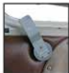
Door Replacement Handles