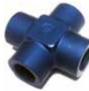
AN918 CROSS INTERNAL PIPE THREAD