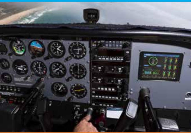
Left to right, the slide-in mounting sequence of the iFDR Panel Mount for the iPad Mini (IFDR-IPAMI) and a typical install.