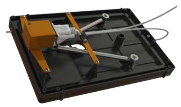
Durable spring tensioned chassis with optional iFDR Power 150-301 Power Supply mounted on back.