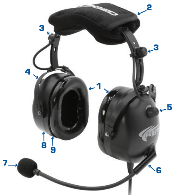
8 & 9 CLOSE UP VIEW