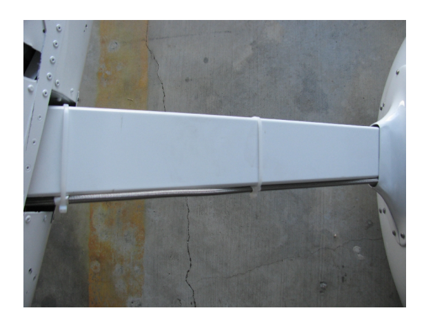
Step 6: Bleed your brake lines. Then test them for sponginess and leaks.