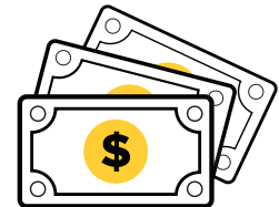
Receive a CASH REBATE up to $70

*The TRADE-IN | TRADE-UP Rebate Offer is for new PARMETHEUS™ G3 SERIES purchases only.