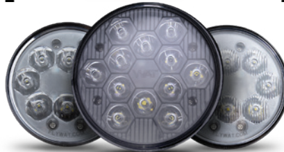
Purchase WAT PARMETHEUS™ G3 LED